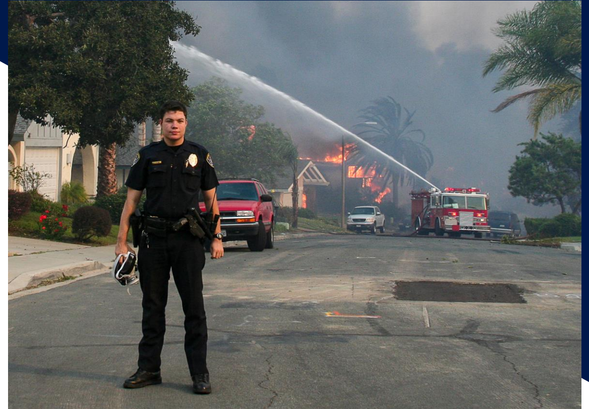
Working in Northeastern Division during 2007 Firestorm